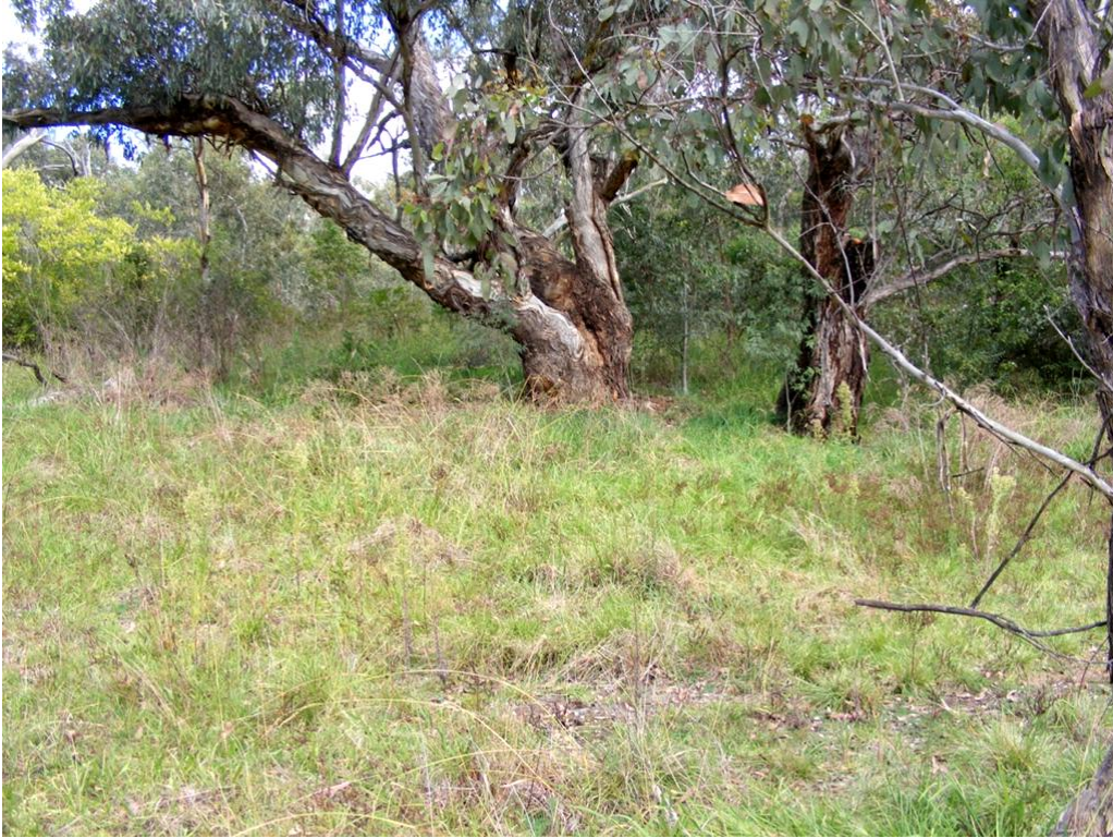
Above: 3 April 2012 showing two trees in background of 1923 photograph of Hostel Camp. Above the big tree is another tree around which was found a large dump. On the left is the site of the Mess building which would have been about 20 to 24ft in length.