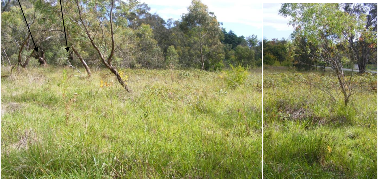
Above: 3 April 2012 and below Hostel Camp 1923. Briar Farm Cottage site off to right.